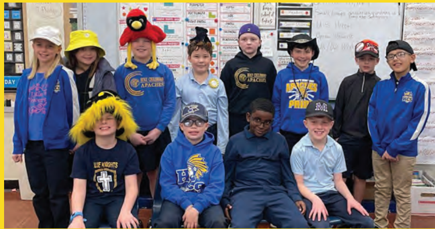
Put on your thinking cap day 3rd grade