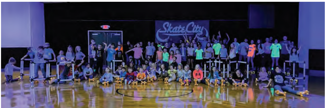
Rolling into the 80's Day for Catholic Schools Week was totally rad! 117 of the HCS student body was in attendance. A special thank you to HOPE for funding and organizing this with Skate City for our students.