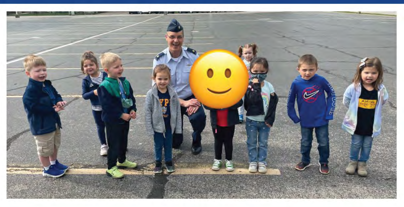
April 25-29 HCS celebrated the Week of the Military Child.